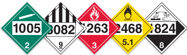
UN NUMBER PLACARDS - DOT 49 CFR