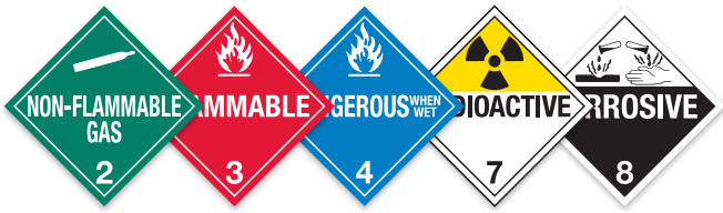
WORDED PLACARDS DOT 49 CFR