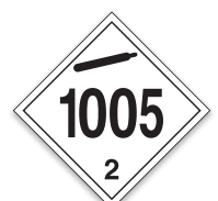
ANHYDROUS AMMONIA PLACARD