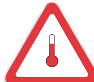
ELEVATED TEMPERATURE MARK