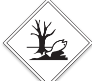
MARINE POLLUTANT MARKING