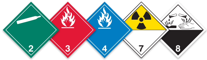
NON-WORDED PLACARDS TDG & INTERNATIONAL