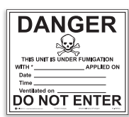
FUMIGATION WARNING SIGN