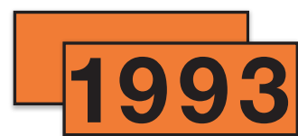
ORANGE UN NUMBER PANELS