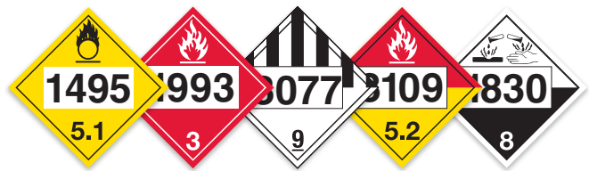
UN NUMBER PLACARDS - TDG