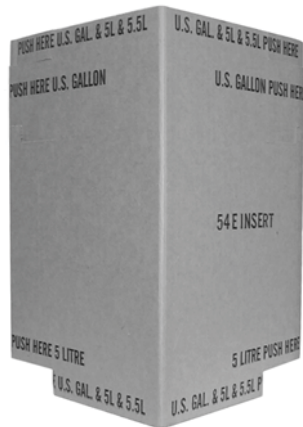
Bottom flap forms "ridge" in outer box

Mark and label each package in accordance with the appropriate regulations. At least one (1) set of UN markings and two (2) orientation arrows must be shown on each package.